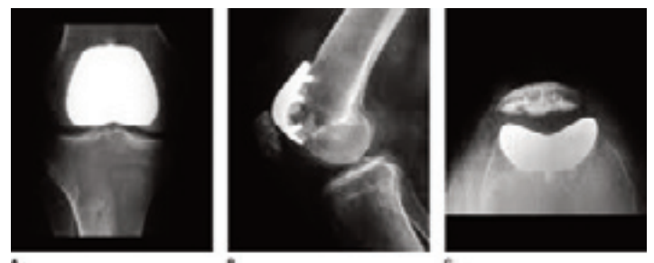
This x-ray taken shows the normal patella position after successful patellofemoral replacement. The plastic patellar implant does not show in an x-ray.

Patellofemoral replacement surgery cannot be carried out if there is arthritis involving other parts of the knee. If this is the case, your doctor may recommend a total knee replacement.